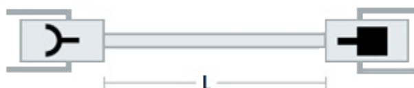
L = 5, 10, 15, 20, 25 meters